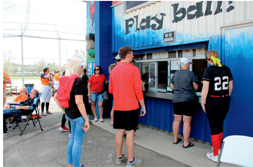
Riverview Softball Complex

Elkhart Parks & Recreation offers concessions for sale at all aquatic facilities, NIBCO Water & Ice Park, and Riverview Softball Complex as well as at various events throughout the year. The new concession trailer made its debut in October at the Drive-In movie at Ideal Beach.