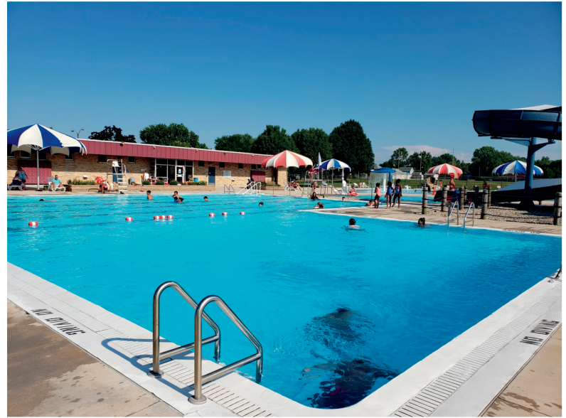
Pierre Moran Pool

Elkhart Parks & Recreation maintains three aquatic facilities that are open during the summer months. Ideal Beach, McNaughton Spray Park, and Pierre Moran Pool provide safe and family-friendly experiences for their patrons.