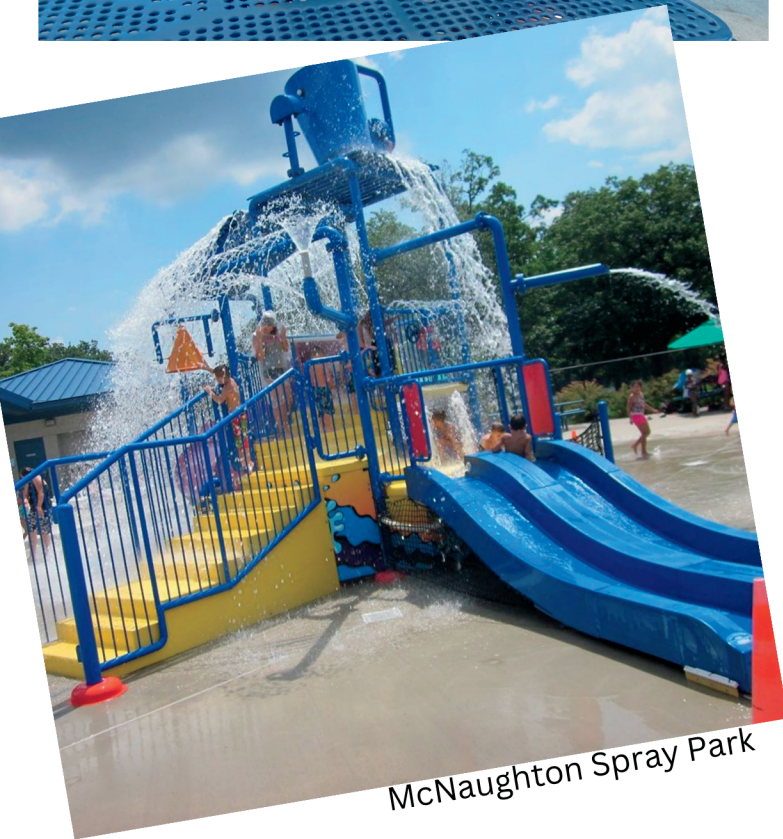
McNaughton Spray Park