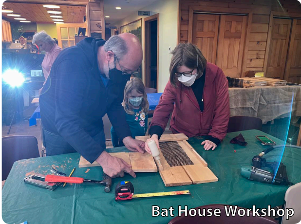
Bat House Workshop