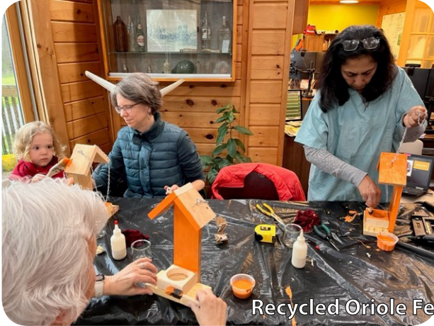
Recycled Oriole Feeder Workshop