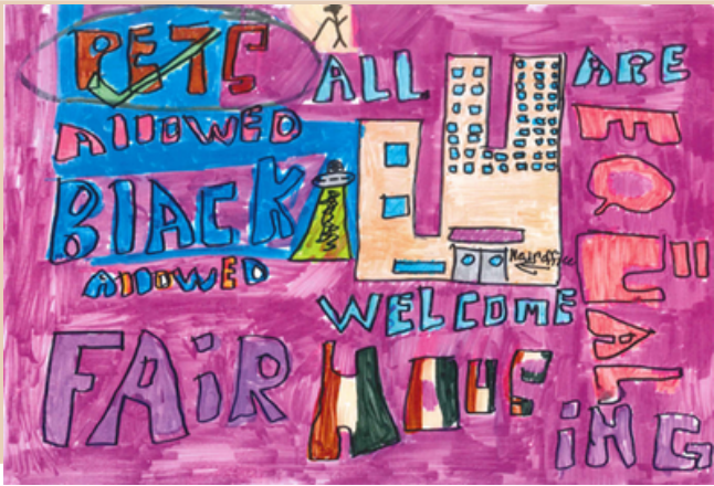
MYA JOSEPH 3RD PLACE GRADES 5-8 CATEGORY